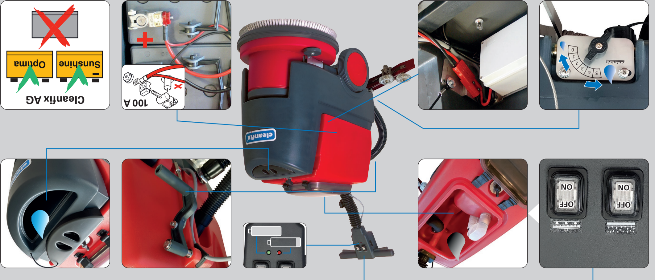
Storage - Lagerung - Stockage - Almacenaje